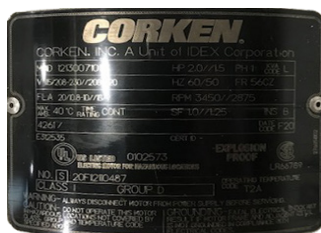
WEG Motor Serial Plate